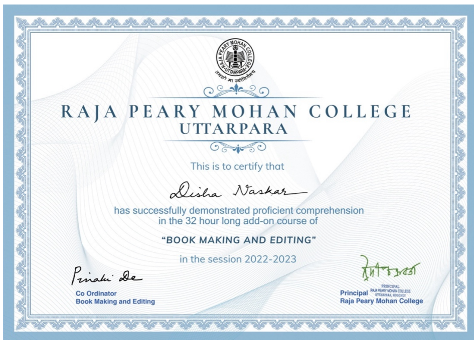
Certificate of Book Making and Editing class