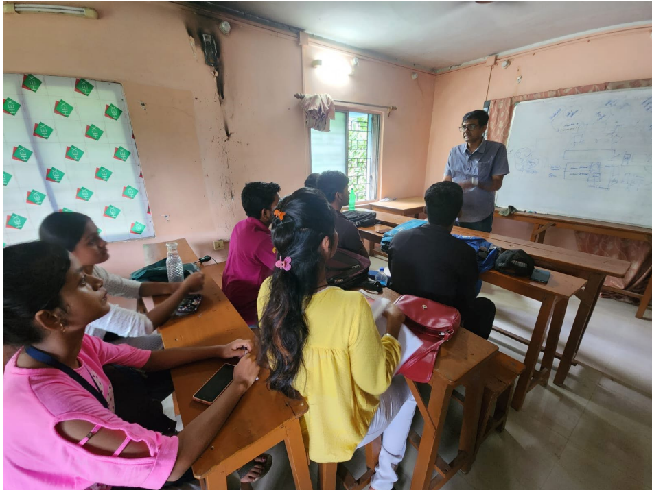
Book Making and Editing class in Progress