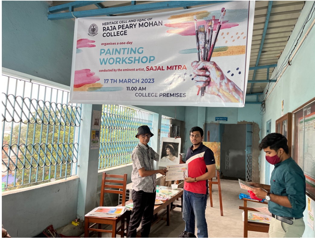
Distribution of Certificates in the workshop