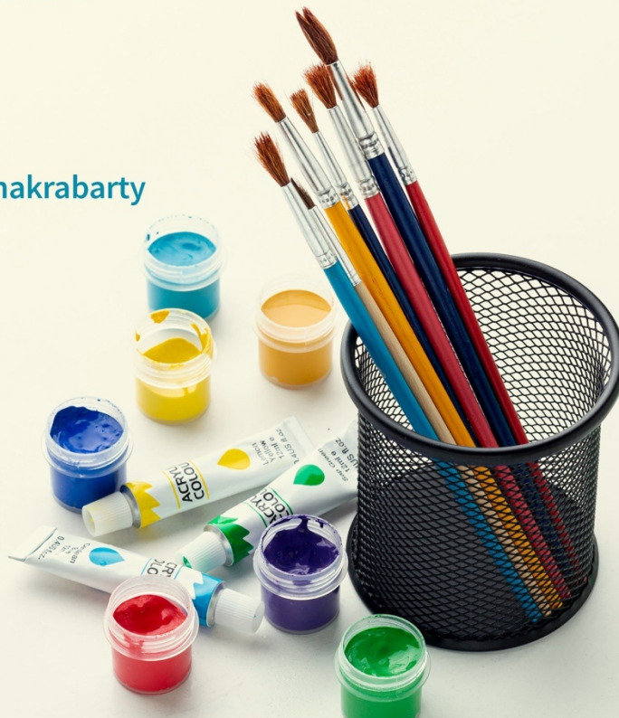
Fig. 1.: Poster of the Add-on Course on Painting and its Applications circulated both digitally and in print.